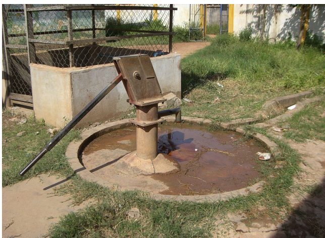
Hand pump tube well