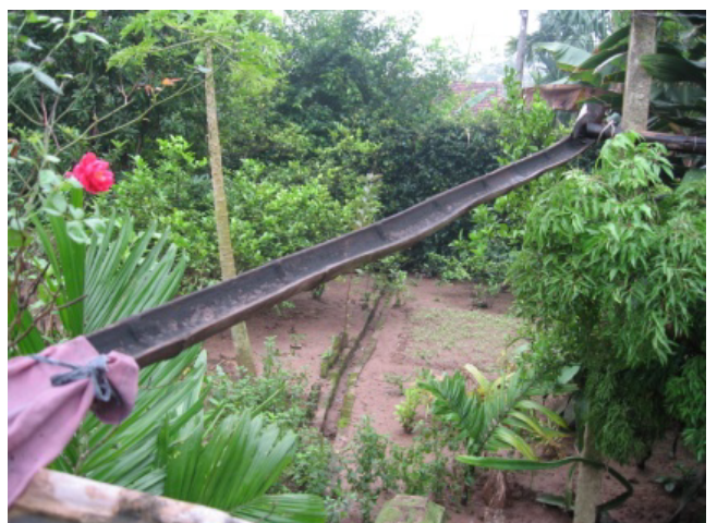
Rain water harvesting tank and pipe