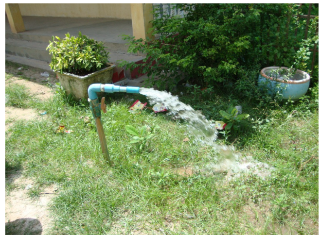
Electric pump tube well