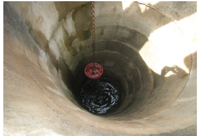
Hand dug shallow well