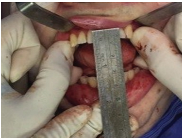
Figure 4: Postoperative mouth opening.