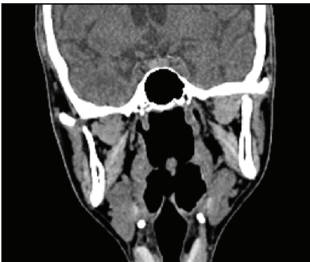
Figure 5: CT scan with 2 years of follow-up.

in relation to the interstitial middle opening and the relapse of group A (silicone) was 4.6% and 7.9% for group B (fascia) from 9 to 10% both in the 3 rd and 6 th post operative month respectively. During the first month, there was no significant difference. However, despite its high cost, the silicone material has the same conditions as the temporal fascia graft. Regards the vertical dimension and ensures interincisal opening. Corroborates the study by Qudah MA, et al. [10], where the success of surgical treatment for ankylosis in 8 patients reached 87.5%.