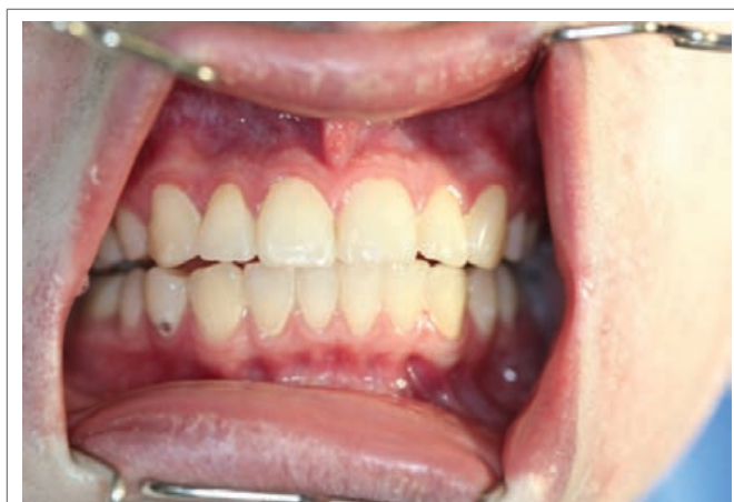
Figure 1: Occlusion view Pre Surgical.

for treatment, because it was a public service which has a lot of difficulties to access this form of treatment and material.