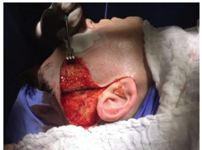
Figure 2: Al-Kaiat Surgical Access.

The patient maintained the follow up with CT scan and clinical examination for two years with Maxilofacial team (Figure 5 and 6) where he presented great evolution in phonation, hygiene, nutrition and speech. We do not choose the temporomandibular joint prosthesis