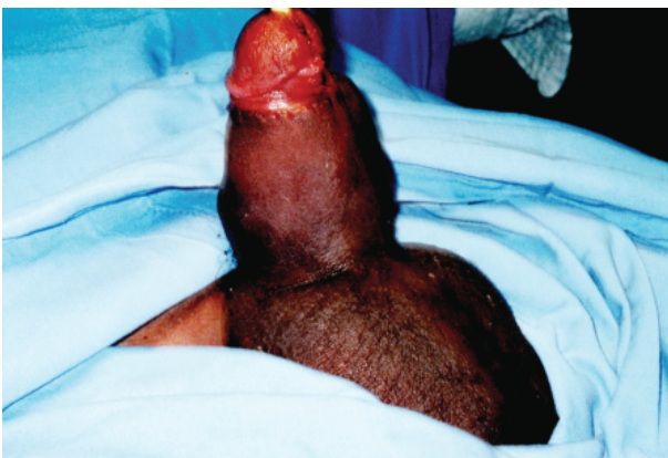
Figure 4: Final aspect of the surgery

was left in until the complete regression of the hematoma upon 7 days when the urinary catheter was finally removed. The authors acknowledge that the ideal catheterization time should have been maximum 48-72 h. However, the delay in the catheter removal was due to the large hematoma that was an exasperating difficulty for the patient to urinate which led the team to arrive at an agreement to the discharge with the catheter to allow for alleviation of the swelling symptoms.