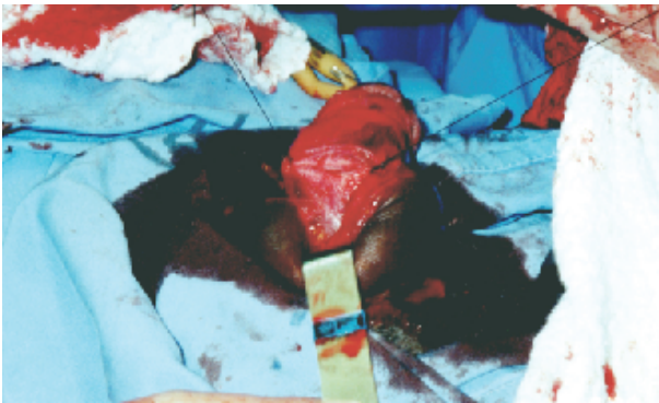
Figure 2: Fracture of the right corpus cavernosum