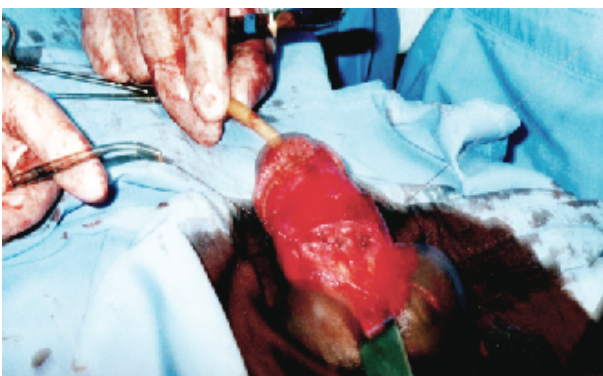
Figure 3: Fracture of the right corpus cavernosum sutured with Vicryl 2.0