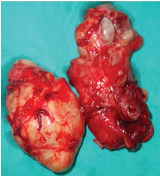
Figure 3: Excised Specimen