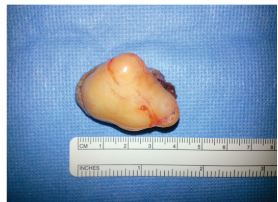
Figure 5: Excised lesion