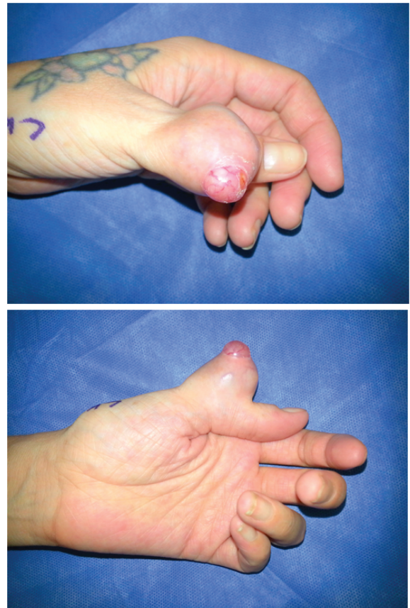
Figure 1: Preoperative view of the left thumb a) Dorsal view b) Lateral view

A 37-year-old right-hand dominant female presented to the senior author's (RD) office with a large painful mass over the dorsum of her left thumb proximal phalanx. Her past medical history was limited to asthma, and her only prior surgery was a Cesarean section. She was a former smoker who quit during her workup of the lesion. She reported that the mass had been present for 12 to 13 years and was continuing to increase in size becoming more and more painful (Figure 1). She denied a history of trauma or any previous lesion at the site.