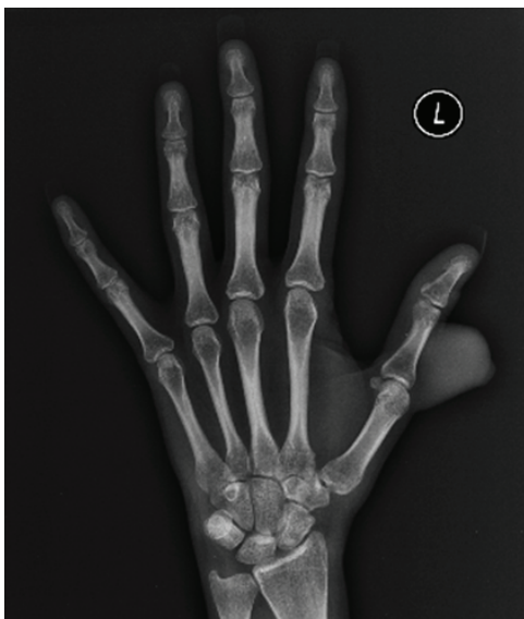
Figure 2: Anteroposterior X-ray of left hand

Digital neurofibromas are rare, there only few case reports in literature [1-6]. Neurofibromas can present as isolated lesions or as a manifestation of neurofibromatosis. The percentage of isolated lesions associated with neurofibromatosis is only 10% [7,8]. The differential diagnosis for soft tissue tumor of the digit is extensive and includes both benign and malignant entities. The most common benign soft tissue tumors of the digits are ganglion cysts, giant cell tumors, fibromas, glomus tumors