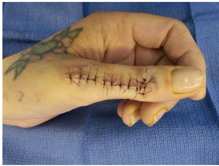
Figure 6: Immediate postoperative view