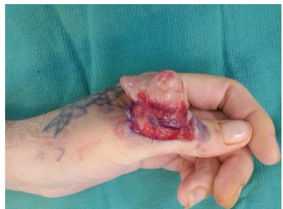
Figure 4: Intraoperative view of lesion