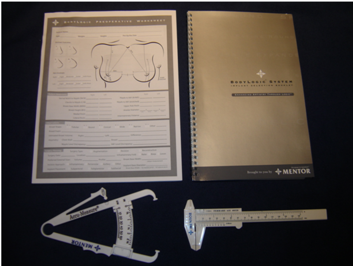
Picture 1: The Anthropometric-Based Implant Selection System Kit: Preoperative worksheets, implant selection booklet, and calipers.

93.64%, respectively. Similarly, the satisfaction rates reported by surgeons over the same time periods were 94.86% and 94.84%, respectively.