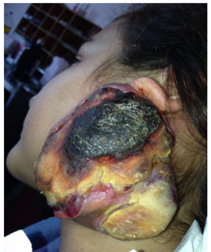
Figure 1: Left parotid gland lesion gradually increased in 6 months

Extranodal non-Hodgkin's lymphomas (NHL) of the head and neck affect Waldeyer's ring, nasopharynx, nasal cavity, paranasal sinuses, thyroid gland, orbit, and salivary glands [6]. Primary parotid lymphomas