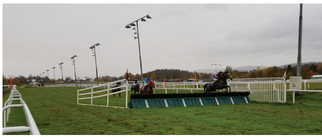
Figure 1: The hurdles at Oevrevoll Race Track. Escape routes on the outer perimeter if the horse or jockey has problems with the jump. The hurdles are lower and have soft upper edges