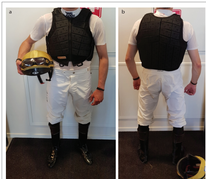
Figures 2a and 2b: The jockeys use obligatory safety equipment including helmets, glasses, torso protection and racing boots

thorough evaluation of the tracks are performed prior to and during race days, resulting in cancellation of races if the track is too wet, slippery or otherwise deemed unsuitable for use.