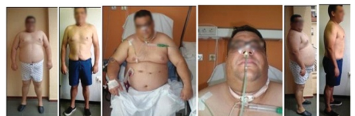
Figure 2: Full body and tracheotomy wound.