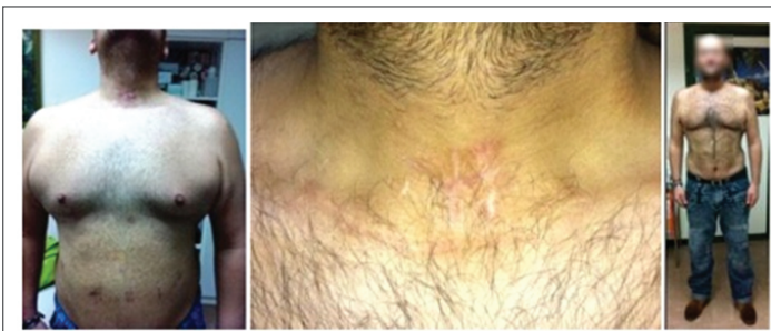
Figure 3: Full body, thyroid & tracheotomy wound.