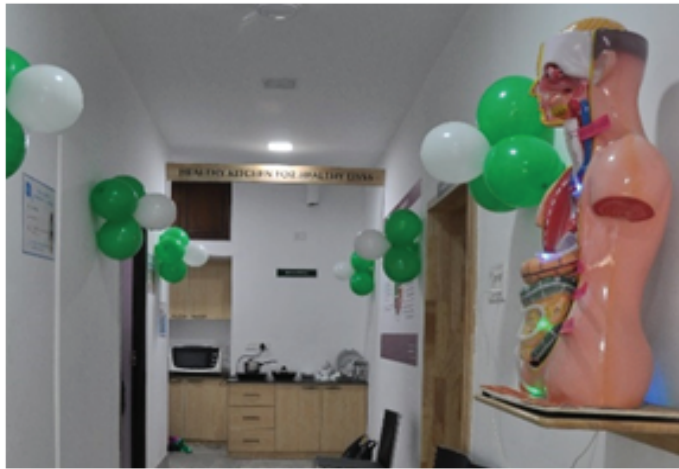
Figure 2: Health Kitchen for Live demonstration