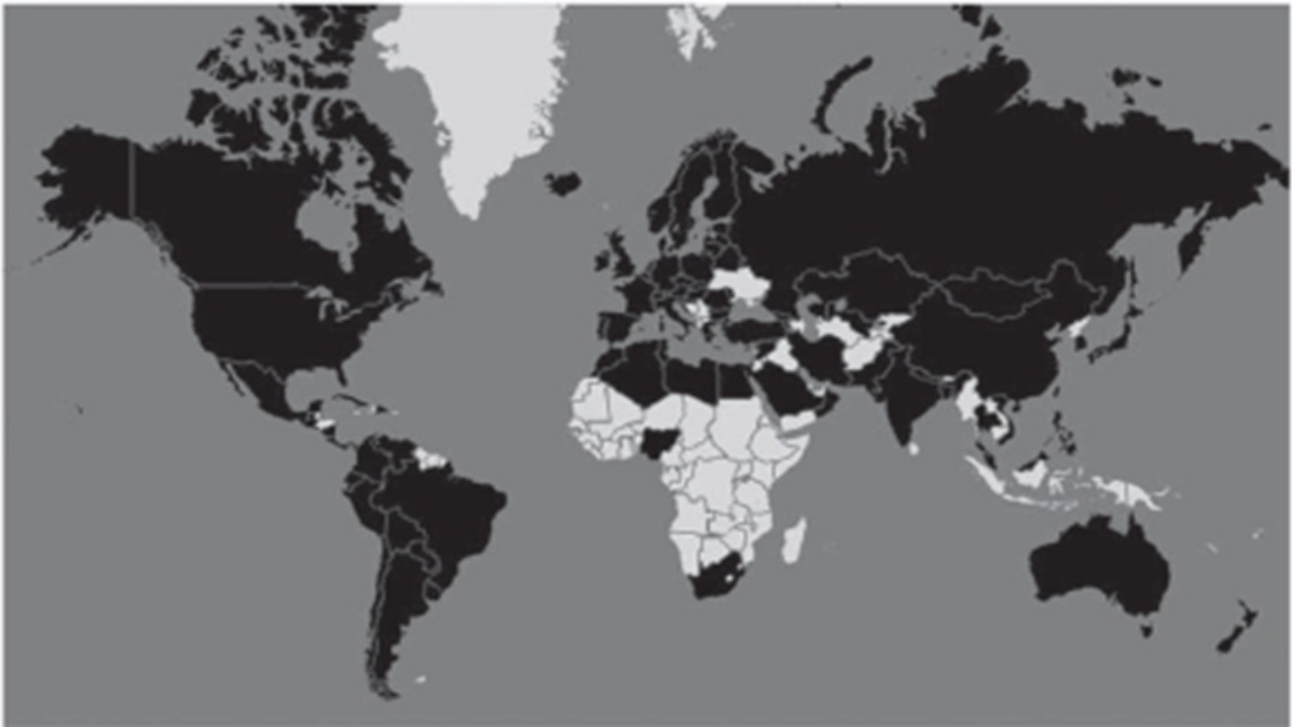
Figure 1: Countries where kidney transplantation is currently performed (black).