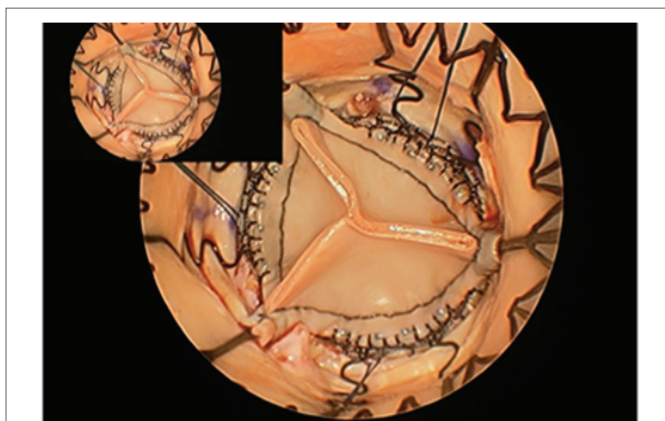
Figure 2: Intraoperative picture-The properly deployed valve mimics a native valve closely. The lack of a sewing cuff aids haemodynamics.