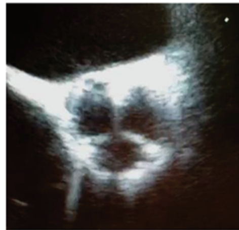
Figure 3: TEE-Mid-esophageal short axis view-A short axis TEE reveals a prosthesis that is very similar to a native valve.