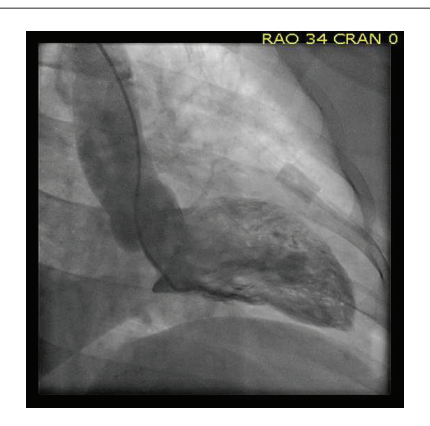
Figure 3: Aortogram and ventriculogram revealing Origin of RCA and anomalous origin of left coronary artery from opposite sinus