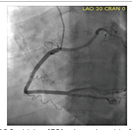
Figure 1: LAO Cranial view of RCA and anomalous origin of left coronary artery from opposite sinus

Young athletes with ACAOS experience SCD from vigorous exercise which sets up a plethora of hemodynamic changes. These changes compromise the anatomical integrity of ACAOS especially if the course is inter-arterial. In one of the largest series ever reported of eighteen year old military recruits undergoing intense military training for eight