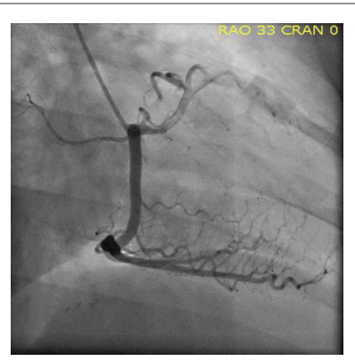
Figure 2: RAO Cranial view of RCA and anomalous origin of left coronary artery from opposite sinus