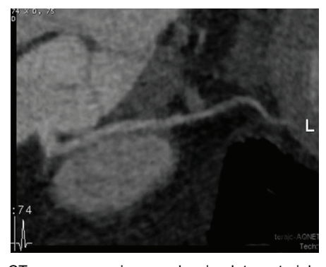
Figure 4a: CT coronary angiogram showing Inter arterial course of left ACAOS

weeks, 277 non trauma related deaths were identified. Of these, 64 were cardiac deaths, 21 of which were related to left ACAOS. No other coronary anomaly was associated with death. This and many other series suggest SCD as the primary presentation in young athletes [3-6]. Adults may remain asymptomatic or have chest pain with typical or atypical symptoms [7].