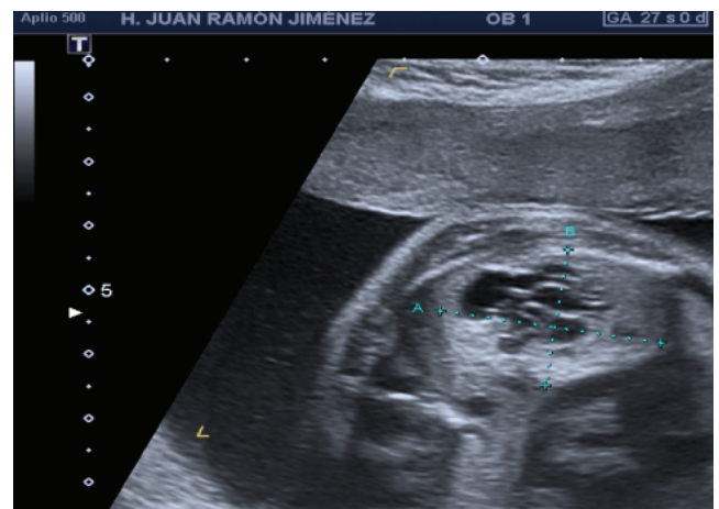
Figure 4: Cross section of the heart: dextroposition and mesoapex.