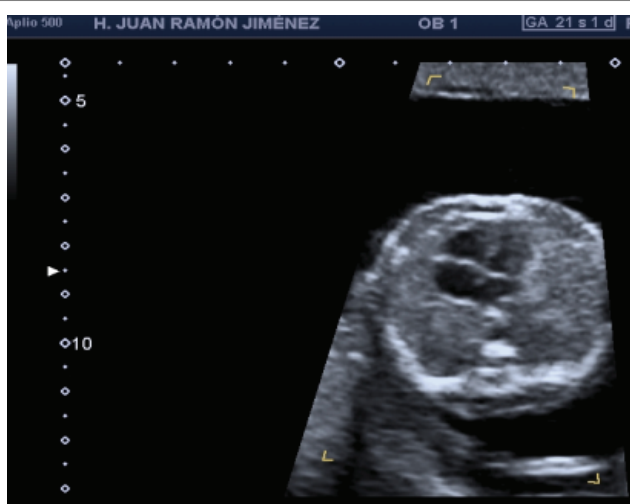
Figure 1: Shows an axial view through the area of cystic adenomatoid malformation of the left fetal lung, type II. Large left-sided lesion displaces the heart to the right.