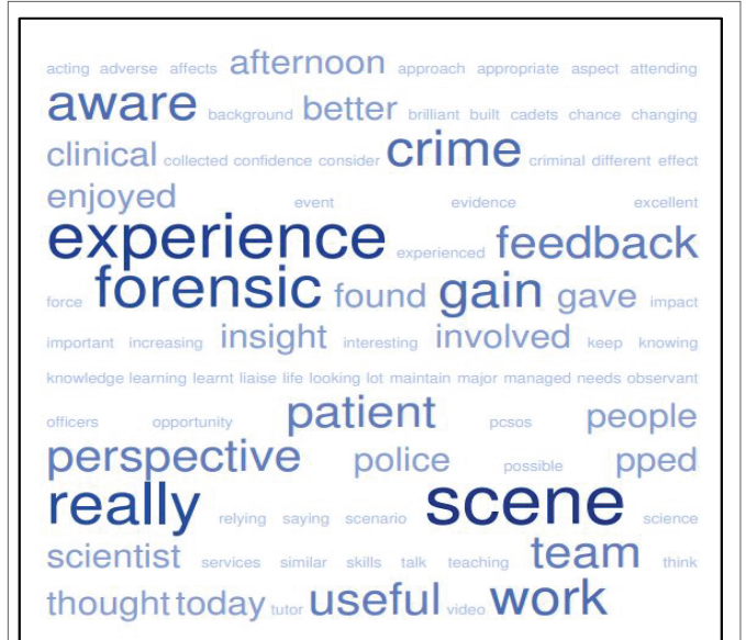
Figure 3: Word Cloud of free text feedback from participants