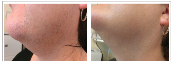
Figure 2: A woman diagnosed with PCOS after 6 treatments with IPL and medication with spironolactone and OCP. Before her 7 th treatment.

Penetration is also dependent on the pulse type and duration, in other words, the time it takes for light to penetrate the skin. Once the correct applicator is selected, we adjust \lambda to the target chromophore. It uses the same principles as that of the Laser but with the versatility of the IPL. By using Ellipse filters and applying the appropriate pulse to the lesion, one laser can perform the same treatments that would normally require the use of several specific laser.