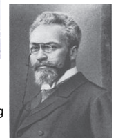
Figure 2: The fathers of modern Diabetology, Paul Langerhans, Oskar Minkowski and Josef von Mering. (Composed by the author with free accessible material)

Clinical Endocrinology flourished and big progress was made in diagnosis and treatment of endocrine disorders in the last decades. A constantly increasing number of endocrine disorders can be explained on a molecular basis now, and detection of mutations in biopsies or tissue probes are already used for classification and personalized therapy, e. g. in thyroid cancer, or in pituitary adenomas.