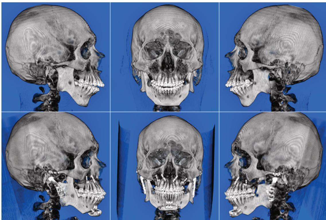
Figure 3: Shows the treatment of adult male complaining of condylar resorption and mandibular retrognathia using Le Fort I osteotomy, bilateral artificial joints, and genioplasty.