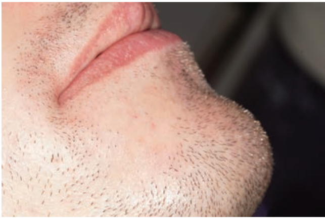
Figure 1: Presentation of the extra oral situs with protrusion of the cheek below the right corner of the mouth.