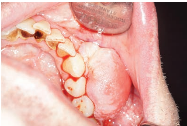
Figure 2: Illustration of the intraoral site (bleeding provoked by infiltration anesthesia).