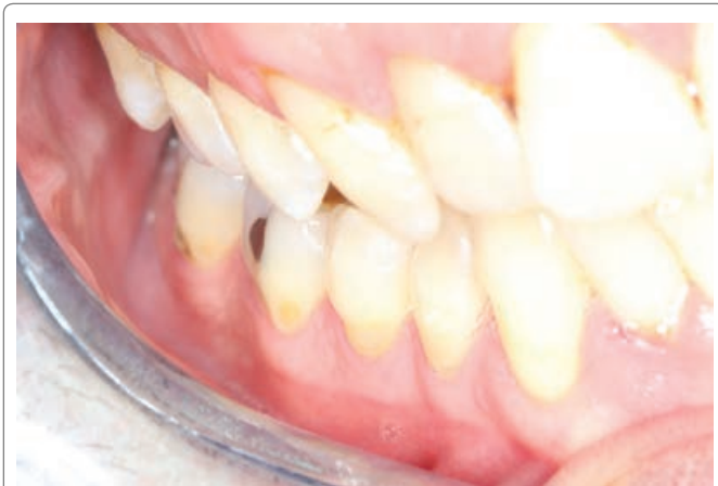
Figure 7: Situs regio 42/46 after complete healing and remodeling 6 months postoperatively.

presented. In this review, odontogenic fibroma is described as benign mesenchymal neoplasia originating in odontogenic mesenchymal connective tissue [1-3].