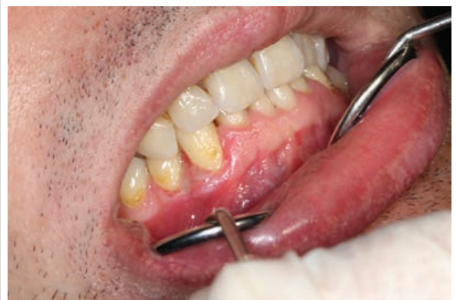
Figure 6: Situs regio 43/44 after initial healing 10 days postoperatively.