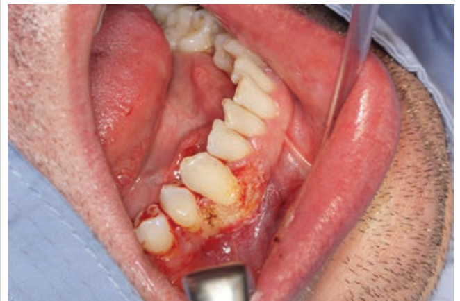
Figure 5: Situs regio 43/44 after electro-surgical excision and after modeling of the marginal gingiva.