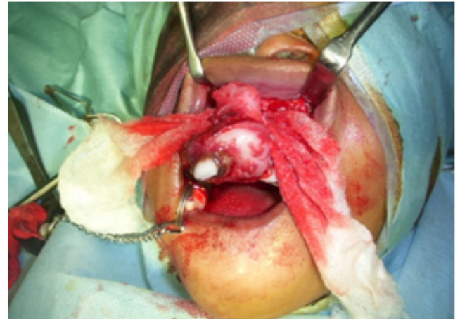
Figure 3: Intra operative picture of the patient

Waldron classified fibro osseous lesions into three main categories namely- fibrous dysplasia, reactive lesions and fibro osseous lesions [1]. The 1992 WHO classification of groups under a single designation (cemento ossifying fibroma) two histologic types cementifying fibroma and ossifying fibroma that may be clinically and radiographically indistinguishable [5]. Gardner suggested that peripheral ossifying fibroma and peripheral odontogenic fibroma are two distinct entities. Peripheral ossifying fibroma is a reactive lesion and peripheral odontogenic fibroma is an extraosseous variant of central odontogenic fibroma. Peripheral cemento ossifying fibroma shows parakeratinised epithelium and well cellularised connective tissue containing mineralized components ranging