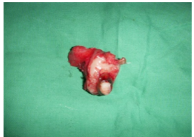
Figure 4: Excised lesion