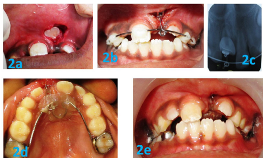
Figure 2: 2a: Surgical exposure of 21, 2b: Begg's bracket bonded to a palatal surface of 21 and wire and composite splinting, 2c: 2 month follow up IOPA, 2d & 2e: Nance palatal arch with the incorporation of hook