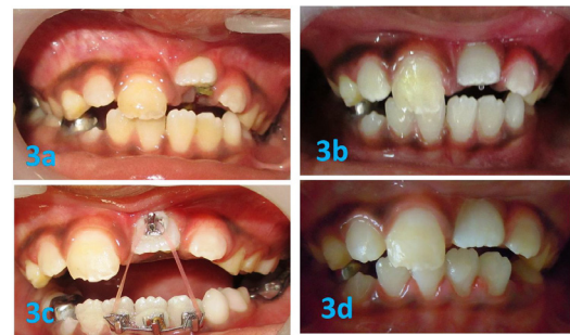
Figure 3: 3a&3b: 4 month follow up, 3c: Orthodontic elastics for incisal movement, 3d: 8 month follow up photograph