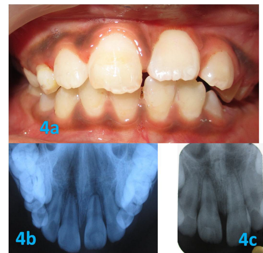
Figure 4: 6 month post treatment photographs

The impaction of permanent central incisors is a well-recognized entity and is usually associated with trauma to one or more primary anterior teeth early in life. Management options for such teeth can be: (i) surgical extraction and moving the lateral incisor to mimic the central incisor and similarly changing the anatomy of other teeth. (ii) Extraction of the impacted tooth followed by an implant. (iii) Surgical repositioning of the impacted tooth, and (iv) orthodontic correction of the impacted tooth [6].