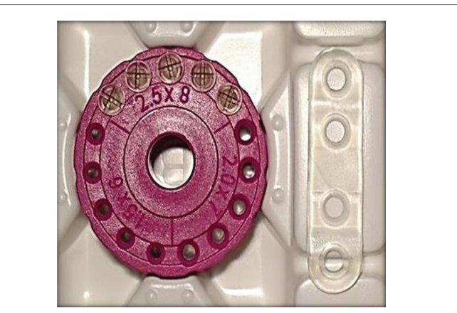
Figure 1: Bioresorbable screws and plates pre-sterilized and made of polylactic acid, poly glycolic acid and poly dioxanone polymers.

Data collection was done at the immediate post-operative period (within 72 hrs.) and at the end of 1,2,4,6 and 8 weeks. These patients were checked for pain, oedema, infection, occlusal derangement, suture dehiscence, paresthesia, anesthesia, plate rejection, malunion, non-union, palpability of plate. Radiographically orthopantomogram (OPG) was done post operatively and on routine follow up, the fracture was accessed on its reduction, changes at the fracture line, sign of osteogenesis, visibility and osteolysis around the drill holes in the case of bioresorbable group of patients. All percentage data were subjected to arcsine square-root transformation before statistical analysis. Data are analyzed statistically using