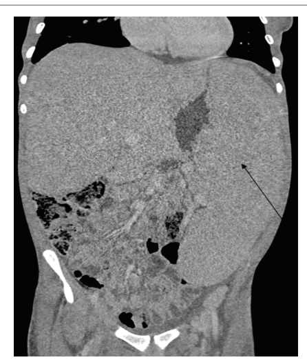
Figure 2: CT of abdomen showing hepatosplenomegally.