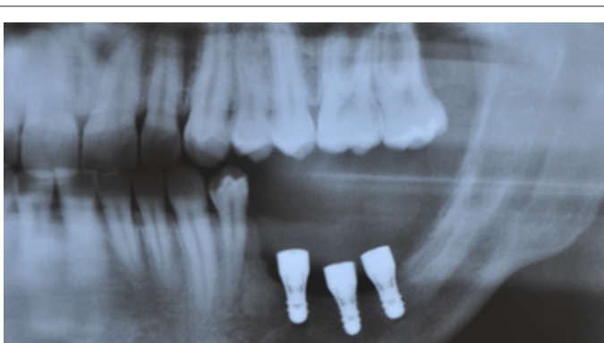
Figure 3: 18 months follow-up – implants were placed after surgical lesion removal.

[12-14]. However, reports in the literature are scarce regarding the installation of short implants in patients who have undergone unicystic ameloblastoma curettage. Data from some studies show that conventional length implants installed in the areas subjected to tumor resection and immediate reconstructions with bone grafts have presented high success rates [15-17]. Additionally, the success rate of prostheses installed on short implants is similar to that obtained with prostheses supported by conventional size implants [18,19].