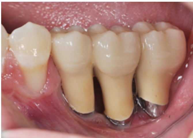
Figure 4: dental metal-ceramic prosthesis after occlusal adjustment.