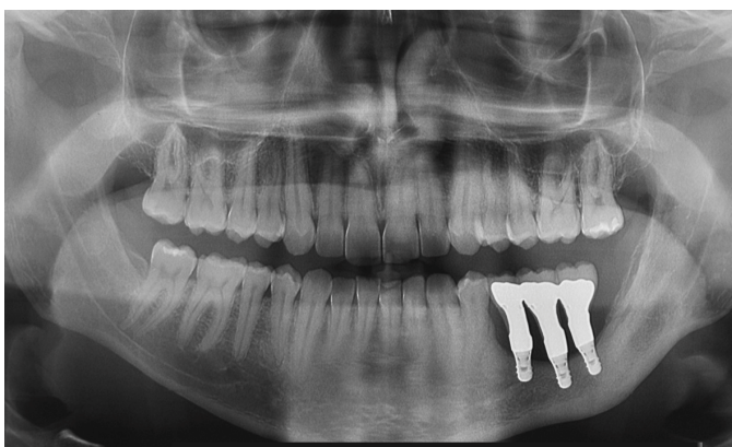
Figure 5: Radiography of the installed prosthesis, taken 24 months later