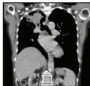
Figure 1: CT taken on initial presentation showing a RUL lesion.

Antibiotics, IVIG*, platelet transfusions and red cell transfusions, were ineffective. Platelets recovered marginally after a combination of IVIG and platelet transfusions but required another round of therapy within one to two days. An autoimmune work-up was negative for the following: c-ANCA*, p-ANCA*, and DAT* (Broad Spectrum Coombs, Anti-IgG Coombs, and Complement). The rest of the autoimmune workup was within normal limits with exception to ANA*: C3 complement 1.01 g/L