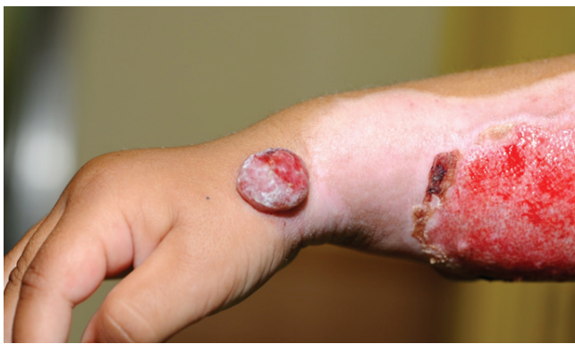
Figure 2: Right Forearm dorsal aspect 3 weeks post burn with newly formed cutaneous lesions.

GNA14 genes. Pyogenic granulomas appear as red fleshy papules, which are typically round or oval raised flexible lesions that occurs most commonly on the acral skin. It grows rapidly, erupting through the skin forming a stalk or pedicle. Size ranges from a few millimeters to centimeters; however they are usually small with an average diameter of 6.5 mm.