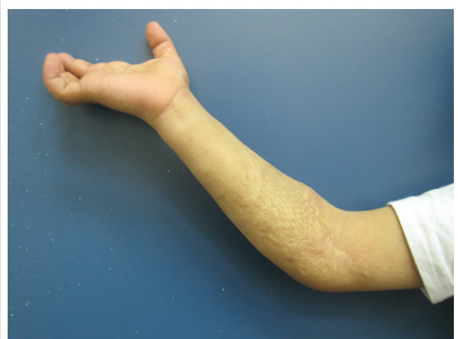
Figure 4: 3 years following skin grafting of proximal forearm.

in the pathogenesis of PG, since trauma or local surgical treatment procedure often precede the lesion's appearance. Increased levels of female sex hormones and unidentified microorganisms such as bacteria [3], fungi and viruses that invade interrupted skin barrier are also suggested to be a possible trigger. The most common complications caused by pyogenic granuloma are bleeding and ulceration.