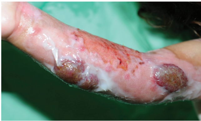
Figure 1: Right forearm volar aspect 3 weeks post burn with newly formed cutaneous lesions.