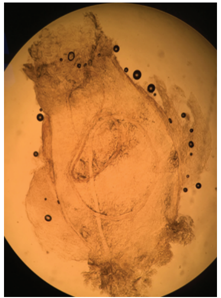
Figure 2: Vellus hair cyst within an intact cyst