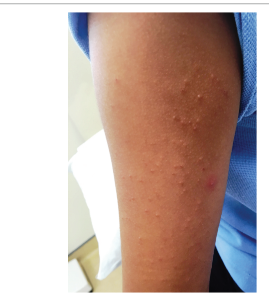
Figure 1: Follicular Hyperkeratotic papules

A five-year-old male presented with multiple, asymptomatic skin lesions on both upper arms, of 3 months duration. The child used to have a good general condition with positive family history of atopy. Physical examination revealed dry skin in general with discrete, symmetrically distributed follicular hyperkeratotic papules, a few of them with tiny white scales protruding from central follicular openings (Figure 1) on the lateral aspect of both upper arms. The condition was diagnosed as a case of keratosis pilaris. When the white scale pulled out non-surgically with non-toothed forceps and examined microscopically in potassium hydroxide preparation, shows a vellus hair cyst within an intact cyst (Figure 2).