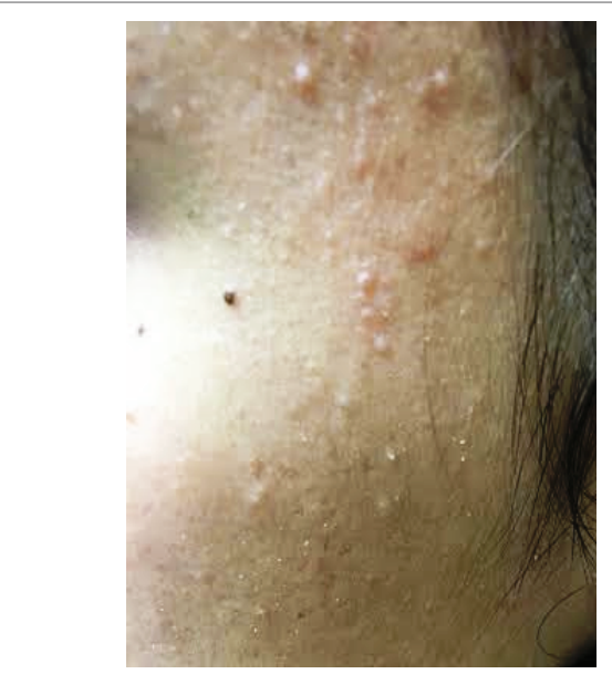
Figure 3: Discrete lesions showing follicular hyperkeratosis

An 18-year-old female patient was presented with an asymptomatic acneiform eruption of face and neck with some lesions on the chest of 3 years duration. Several modalities of acne treatments have been used, topical and systemic, with no improvement. A skin examination showed inflammatory papules with black and white heads. In the same distribution, a few discrete lesions show follicular hyperkeratosis with the central protrusion of a little white scale (Figure 3). A vellus hair within intact cyst is shown with non-surgical pull out of the scale with non-toothed forceps and examined microscopically in a potassium hydroxide preparation (Figure 4).