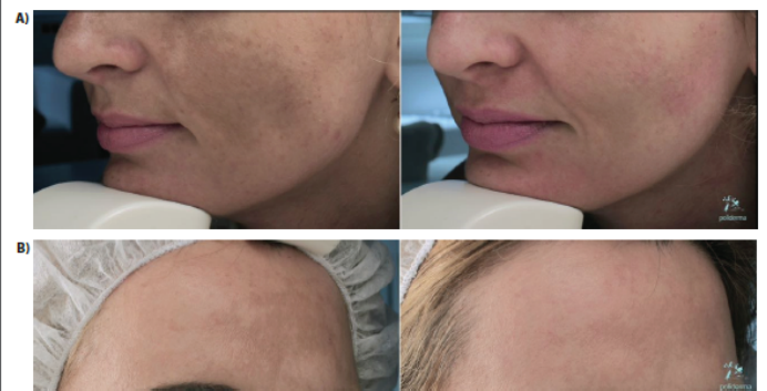
Figure 3: After 30 days before and after only with white skin 1 cream

27 out of 30 subjects reported satisfaction with the results. Of those, 20 were extremely satisfied with results, and 7 were very satisfied. Aside from significant reduction in hyper pigmentation, they reported improved skin quality and texture, as well as reduction in skin pores. 2 out of 30 patients reported moderate satisfaction with results, while 1 patient reported that she is not satisfied.