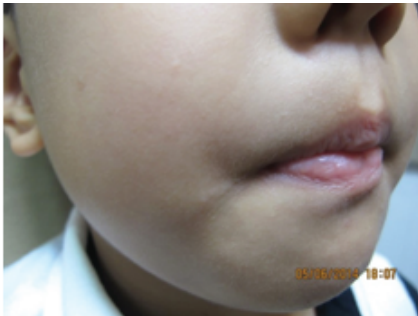
Figure 3: There is no recurrence at 18 months follow-up (6/5/2014).