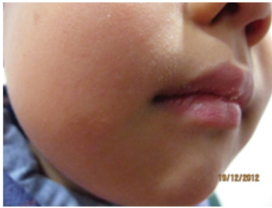
Figure 2: A complete clearance of café au lait spot (after treatment:12/19/2012)