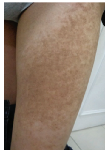
Figure 8: Becker's nevus on the left thigh (before treatment)