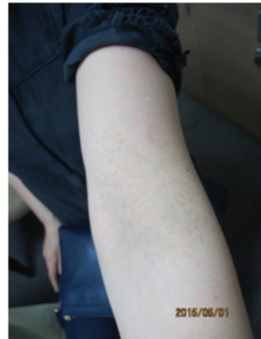
Figure 6: Partial unilateral lentiginosis on the left antecubital area (before treatment)