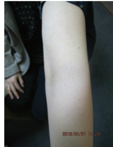
Figure 7: A complete clearance of partial unilateral lentiginosis on the left antecubital area (after treatment )