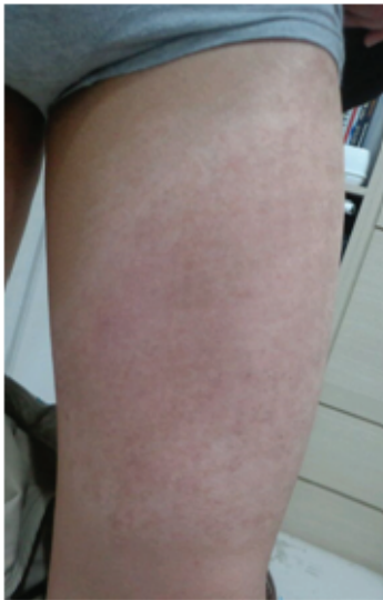
Figure 9: A complete clearance of Becker's nevus (after treatment)

effects such as petechiae, crusts, pain, and PIH during the laser treatment. Therefore, the authors suggest a high fluence 1064 nm Q-switched Nd: YAG laser treatment achieves complete clearance of CALS, PUL and BN with a very safe and effective profile.