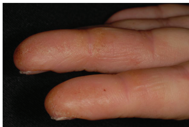
Figure 2: Dyshidrosiform dermatitis on the fingers

Received date: 09 Feb 2016; Accepted date: 07 May 2016; Published date: 11 May 2016.