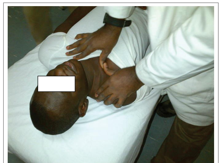
Figure 1: Positioning for sternoclavicular inferioanterior glide

Corner stretching exercise: This exercise was carried out to stretch tight pectoral muscles and fascia. The patient stood and faces the corner of the treatment room with each palm on the walls of the room that form the corner. He was then instructed to leans his body toward the corner without moving his hands or forearms on the wall and then reverses the movement. 3 sets of 10 repetitions of this exercise was carried out in a session.