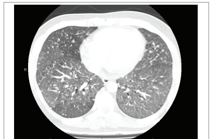
Figure 1: Chest tomography demonstrating ground glass opacities, small centrilobular nodules, and randomly distributed nodules.

Initially his fever and hypoxia improved, but by HD#12 he suffered respiratory distress and progressive sepsis requiring intubation with