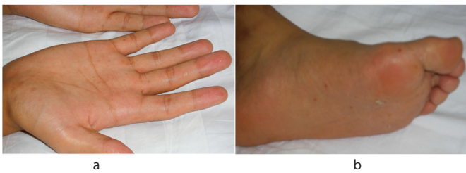
Figure 1: a) HFMD: vesicular rash on palms. B) HFMD: vesicular rash on feet