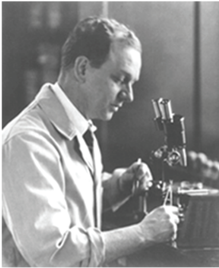
P. Rous a few years after the discovery of RSV.