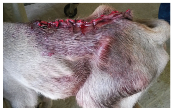
Figure 2: The buffalo-calf after surgical excision of the massive dorsal thoracolumbar teratoma.

Pharmaceutical Industry Co., Egypt). The calf was positioned on the lateral recumbency on the operation table. An elliptical incision was made around the mass through the skin and subcutaneous layers. A process of sharp and blunt dissection was started from the most upper border of the mass. The mass was highly vascularized. Hemostasis was achieved using a combination of direct pressure with sterile gauze sponges and bipolar electrocautery. However, ligations were applied to large blood vessels when needed, especially on dissection of the mass from the underlying thoracolumbar muscles using synthetic absorbable suture no 5-0. The mass was excised totally from the back of the calf. The site of operation was checked for any hemorrhages. The removal of the mass revealed intact underneath thoracolumbar muscles. The defect was closed on two layers; the subcutaneous layer using synthetic absorbable suture no 0 in a simple continuous fashion and the skin layer using silk no 1 in an interrupted horizontal lambert manner (Figure 2). Post-operatively, the calf was administered 2ml Norcilline L.A. (procaine penicillin G 150mg/ml and benzathine penicillin G 112.5mg/ml, Norbrook), IM, once daily for five consecutive days and 3ml Finadyne (flunixin, 50mg/ml, MSD, Animal Health), IM, once.