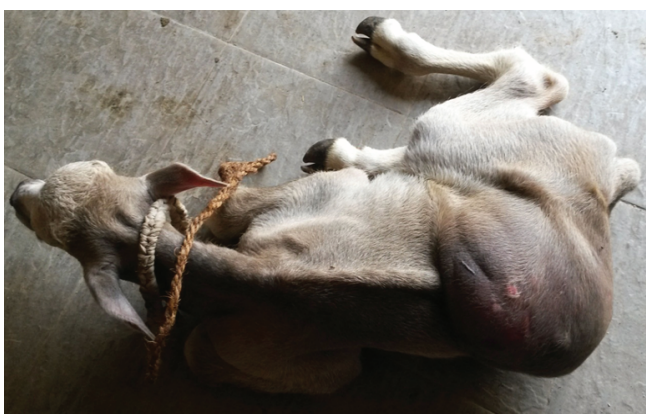
Figure 1: A congenital massive dorsal thoracolumbar teratoma in a buffalo-calf.