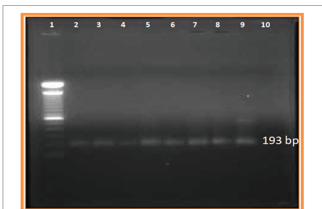
Figure 1: Agarose Gel electrophoresis of PCR products of V3 region Lane 1: 100 bp DNA Ladder; Lane 2 to 9: PCR product (193 bp).

The authors declare that they have no conflict of interest.